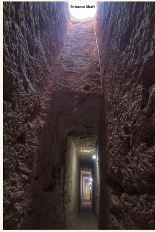
From the Ministry of Tourism and Antiquities

Parts are submerged. An inscription was found on the wall but has not been analyzed yet. Martinez believes it functioned as an aqueduct due to its similarities with the Eupalinos aqueduct tunnel in Greece.