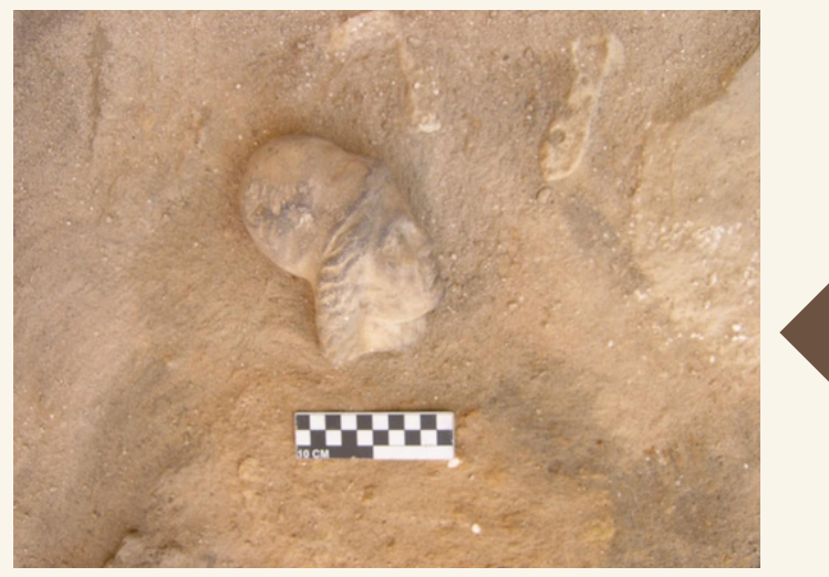
From the Ministry of Tourism and Antiquities